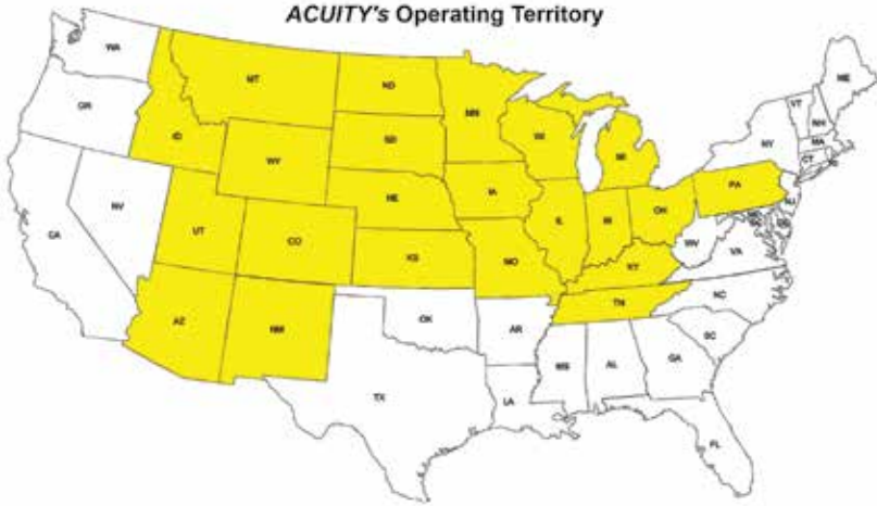
ACUITY's Operating Territory